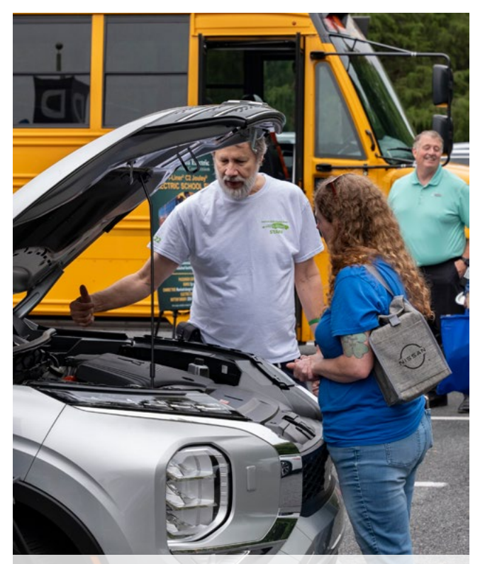
Representatives from the Triad Electric Vehicles Association (TEVA) answered practical questions about EV performance.

Dealerships including Ford, Chevrolet, Toyota and Subaru allowed visitors to test drive new vehicles, so they could understand the EV experience firsthand.