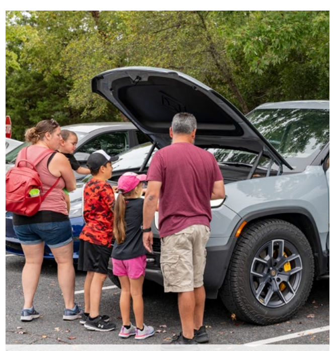
Families were able to see new electric trucks, like the Rivian.

Dealerships including Ford, Chevrolet, Toyota and Subaru allowed visitors to test drive new vehicles, so they could understand the EV experience firsthand.