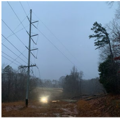
Storm damage from the Jan. 3, 2022 winter weather event

In the event of a contested election, the Credentials & Election Committee will work directly with an independent third party to conduct this year's election in advance of the Annual Meeting. If there is a contested election, we will provide additional information on the voting procedures in future issues of Watts Working .