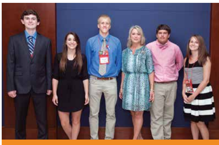
With Congresswoman Renee Ellmers

Even more incredible were the moments I shared with our local North Carolina representatives, especially Renee Ellmers, my local representative. It was surreal talking with them and discussing current issues and solutions. This interaction was one of the main reasons this trip was valuable and why I believe Randolph EMC sponsors young adults for this unique experience. Electric cooperatives are connected to and interact with their customers much like our representatives for our state. They invest in people and appreciate their input. The service they provide to rural areas is critical and they take their work very seriously. Like our state representatives, electric co-ops value and listen to the people they serve.