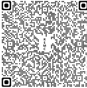
You can watch a video of REMC constructing the tie-lines in early December by scanning this QR code on your phone or device.

One person outside our organization told me that the rotating power-ups would not work. This person claimed that after members received power, they would be mad when we deenergized their homes again. Fundamentally, he assumed that neighbors would not be willing to help out their neighbors on the next